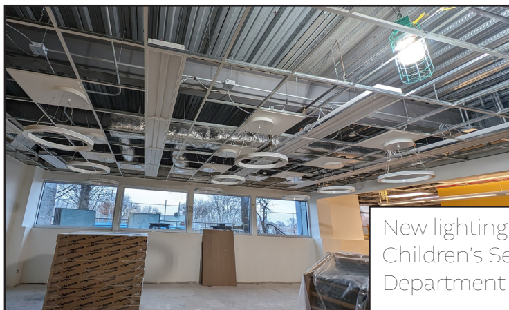
New lighting in the Children's Services Department